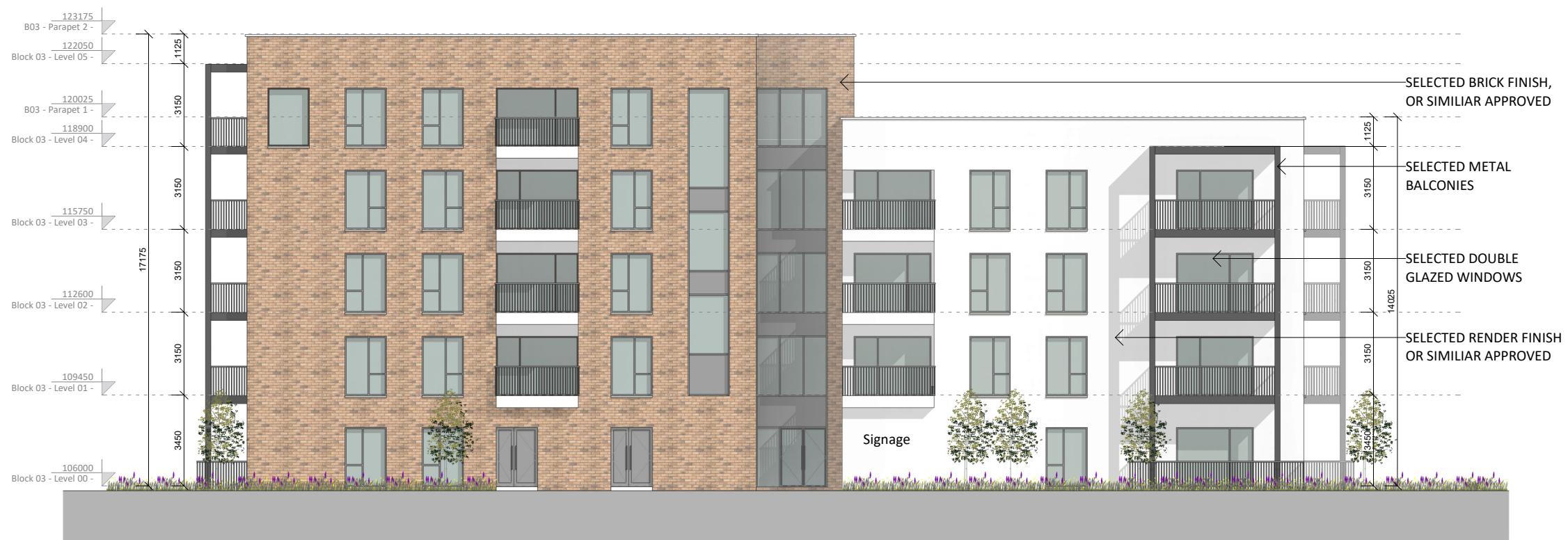
② Block 03 - West Elevation 1 : 200