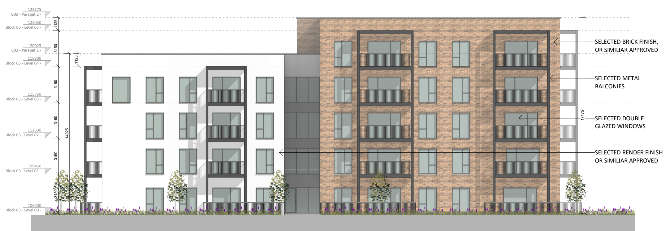
① Block 03 - East Elevation 1 : 200